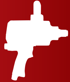
295A Impactool™ 1" Drive