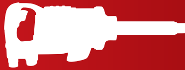
285B-S6 Impactool™ #5 Spline drive includes extended 6" anvil