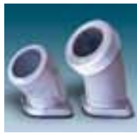
Discharge (Hose, BSP, NPT)