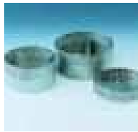
Strainers in stainless steel

The WEDA 10 have a cost-effective sealing solution.