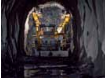
Mining & Tunnels